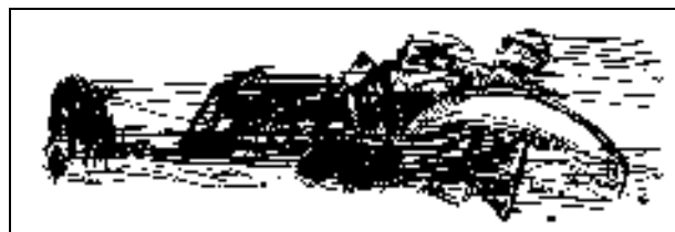
Official Rob Roy Hillclimb Logo ©

It was also the venue for the first Victorian and Australian Hillclimb Championship in 1938.